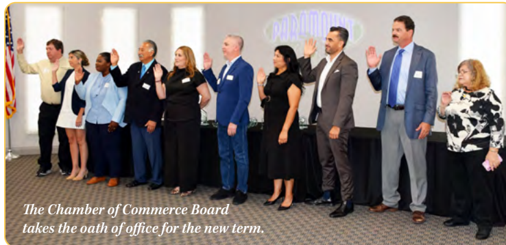
The Chamber of Commerce Board takes the oath of office for the new term.

Throughout the past year, the Paramount Chamber of Commerce continued to serve as an invaluable bridge between businesses and the community. This could not have been