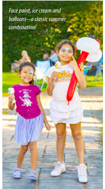
Face paint, ice cream and balloons—a classic summer combination!

A large and enthusiastic Paramount crowd celebrated the 2025 National Night Out on July 24 at Progress Park in conjunction with a lively summer concert series performance by the Pickleback Shine band.