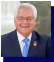
CA Senator Bob Archuleta