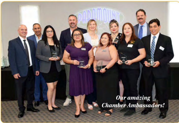
Our amazing Chamber Ambassadors!