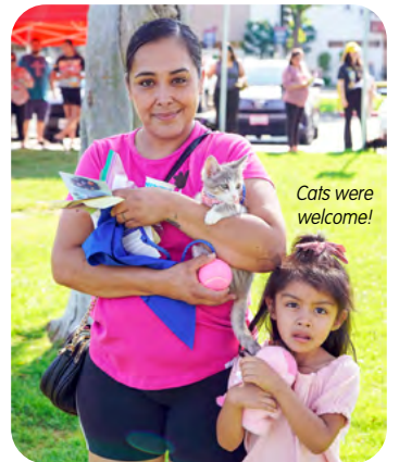
Cats were welcome!